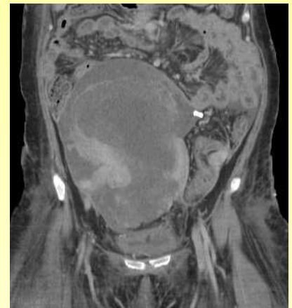
Figure. 1 Ill-defined myometrium with peripheral enhancement rim on computed tomographic imaging

Uterine necrosis is rare, mostly happened after B-Lynch or arterial embolization. In this case, uterine necrosis may result from surgical suturing techniques, hypovolemic shock, and infection. Common presentations of uterine necrosis include fever, lower abdominal pain, and leukorrhea. Hysterectomy is the treatment of choice for uterine necrosis. Sonography could be as first diagnostic tool, but it is not as sensitive as CT or MRI in our opinion. We would like to present this case with CT imaging of absence of enhancement in the myometrium and peripheral enhancement rim, and finally proved to be uterine necrosis pathologically. Patients who receive B-Lynch or arterial embolization develop fever, abdominal pain, and abnormal vaginal discharge, CT could be a useful diagnostic tool for uterine necrosis.