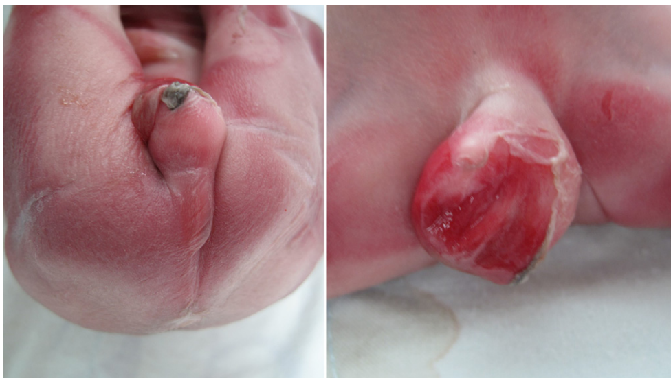
Fig. 3. An imperforate anus and a perineal cyst at birth.