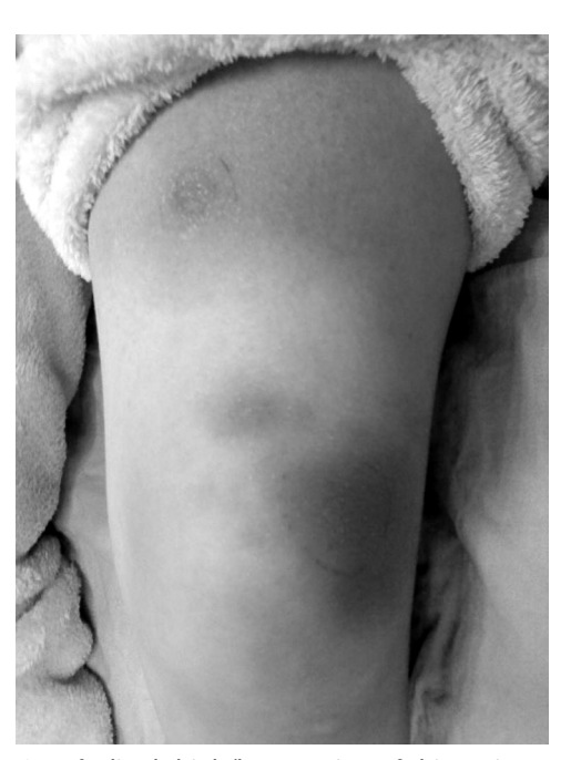
FIGURE 2. Left distal thigh/knee region of this patient. Varying-sized erythematous skin lesions developed in the trunk and extremities. Pathology of the skin lesion demonstrated subcutaneous fresh and hemorrhagic granulation tissue distributed in lobular pattern with evident erythrocyte extravasation, but no evidence of subcutaneous/dermal leukemic infiltration identified by myeloperoxidase, CD33, CD3, CD20, and TdT stains. Six days later, cultures taken from lesions over her left thigh showed groth of P. aeruginosa. Therefore, the diagnosis of cutaneous manifestations of Pseudomonas sepsis was made. Two weeks after her presences of cutaneous septic emboli, the patient died of uncontrolled systemic infection despite aggressive antibiotic treatment. P. aeruginosa is one of the most common opportunistic nosocomial pathogens, which mainly affects immunocompromised patients in hospitals and results in high morbidity/mortality.<sup>6,7</sup> Furthermore, P. aeruginosa infection is increasing because of antimicrobial selection pressures, the wide use of immunosuppressive treatments, the higher survival rate of immunocompromised patients, endemic hospital reservoirs, invasive procedures that allow the organism to penetrate the host, and changes in lifestyle (saunas, jacuzzis, contact lenses, etc).<sup>6,8</sup> The presence of multiple cutaneous lesions, a delay in diagnosis and treatment, and the existence of severe neutropenia imply an unfavorable course.8 Gallium-67 scintigraphy permits whole-body imaging and provides information on pathophysiological and pathobiochemical processes. The precise mechanism in normal and pathologic tissues is not completely understood. 10 Generally, it is widely accepted that the iron analog gallium binds to circulating transferrin receptors (CD71), and the gallium-transferrin complex extravasates at the inflamed/infected site. Then, gallium is transferred to lactoferrin (excreted by leukocytes) and siderophores (produced by microorganisms growing in a low-iron environment).<sup>9,11,12</sup> Because of the multifactorial mechanism of gallium-67 uptake, gallium-67 scintigraphy may be useful in a neutropenic/pancytopenic patient. This case with cutaneous manifestations of Pseudomonas sepsis reminded clinician and nuclear medicine physician to notice the potentially fatal finding on gallium-67 scintigraphy.