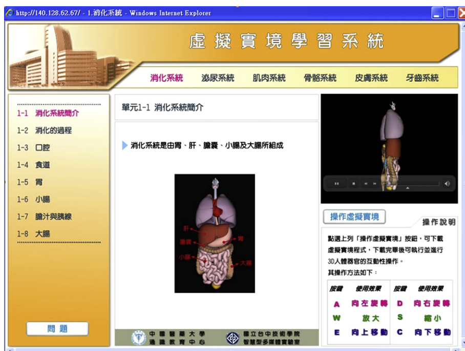
Fig. 1. The main screen of the VBS-ATS.

The three critical factors of VR applications for motivating students' learning are the intuitive interaction, the sense of physical imagination, and the feeling of immersion. VR applications should aim to simulate reality as faithfully as possible (Stone, 2002). Sutcliffe and Gault (2004) stated that successful VR application should have the following characteristics: (a), natural engagement, interaction should approach the user's expectation of interaction in the real world as far as possible. (b), natural expression of action. The representation of the imagination in the VR should allow users to act and explore in a natural manner and not restrict normal physical actions. (c), realistic feedback. The effect of the user's actions on virtual world should be immediately visible and conform to the laws of physics and the user's perceptual expectations. It means that realistic feedback provides effective interaction. (d), navigation and orientation support. The users should always be able to find where they are in the VR environment and return to known, preset positions. In other words, navigation and orientation