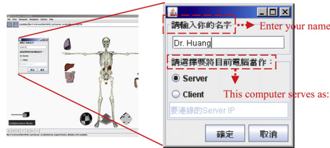
Fig. 2. Collaborative set up in a typical classroom setting. The instructor initiates a 3D-HOL server instance.

The questionnaire was initially drafted by referencing survey questions used in published literature (e.g., Lai et al., 2009; Liaw et al., 2007) that served as the basis of the conceptual model in this research. These dimensions, along with source of references, are listed in Table 3 (Burdea & Coiffet, 2003; Davis 1989; Lai et al., 2009; Liaw et al., 2007; Mantovani, 2003; Pan et al., 2007; Sherman & Craig, 2003; Tax'en & Naeve, 2002). A total of 40 items were first proposed. To enhance the content validity, three experts in the field were invited to review the questionnaire. Each item was assessed against the following criteria: (1) relevance to the objectives of this research, (2) appropriateness of the wording and (3) clarity of question. Items with assessed scores below a certain level were deleted. Unclear questions were modified or rephrased. To increase the validity of the measures used, a pre-test of 35 items was conducted. A total of 30 learners attended the pre-test. After pre-test, the questionnaire was revised to 25 items.