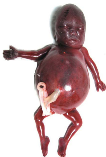
Figure 2. The fetus at birth.

ultrasound abnormalities were IUGR (16.2%), brain structural abnormalities (13%), hyperechogenic bowel (13%), ventriculomegaly (12.6%), microcephaly (9%), ascites (7.2%), oligohydramnios/anhydramnios (5.4%), hydrocephalus (4.7%), hydrops fetalis (2.9%), placentomegaly (1.8%), polyhydramnios (1.4%), pericardial effusion (1.4%), and pleural effusion, skin edema and liver calcifications (< 1%). The overall detection rate of ultrasound abnormalities in pregnancies with congenital CMV infection was 41.9% (116 of 277) as compiled from previously published data [5,18–23].